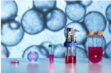
Figure 2 Various bioreactor systems for cultivating induced pluripotent stem cells (iPSCs) on microcarriers.