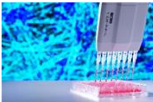
Figure 3 In vitro pharmacological and toxicological screening involving neural cells.